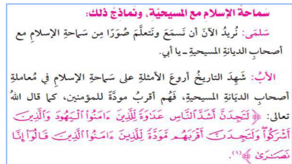
Islamic Culture, Grade 9, 2021-22, pp. 25-26

A Grade 9 Islamic Culture textbook teaches about “Islam’s tolerance of Christianity,” while using a Qur’anic verse that identifies Jews as “ the most intense of the people in animosity toward the believers. ” The textbook illustrates a conversation between a daughter and her father, the former asking about how Islam has treated Christians with tolerance.