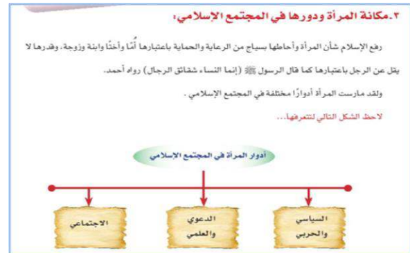
Egypt and Islamic Civilization, Grade 11, 2022-23, p. 130.

Another characteristic of al-Azhar textbooks is their conservatively restrictive approach to gender issues, compared with the general Egyptian education system. The general curriculum demonstrated “progressive conceptions of women’s rights”: it teaches about equality in the labor force and in managing the household, and about various role models who have contributed to the status of women in Egyptian society (such as Doria Shafik, one of the leaders of the women’s liberation movement in Egypt). 74 The textbooks also teach about the dangers and impropriety of female genital mutilation ( khitan ). 75 Even in references to women in Islamic studies, textbooks of the general system harbor progressive views. For example, a Grade 11 Egypt and Islamic Civilization textbook teaches about women’s positive role in Islamic society throughout history in the fields of politics, warfare, preaching Islam, and contribution to knowledge and social welfare. Many examples of influential Muslim women are given, while students are encouraged to be inspired by these role models and actively serve society themselves. 76