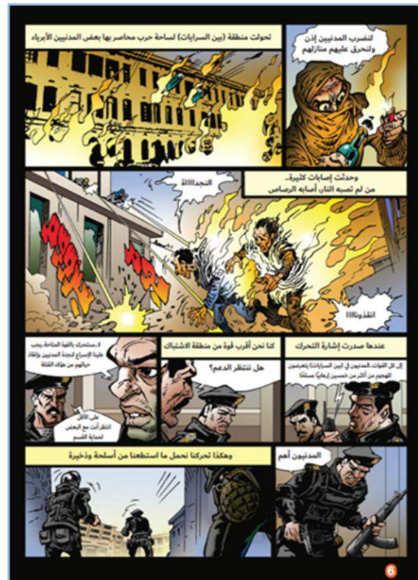
Lions of the Homeland, Grade 8, 2019, pp. 4-6.

[Terrorists] Let's attack the civilians then and burn their houses down with them.